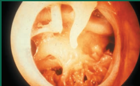
This patient has a hole in their right ear drum. The small ossicle bones can be seen through the hole.